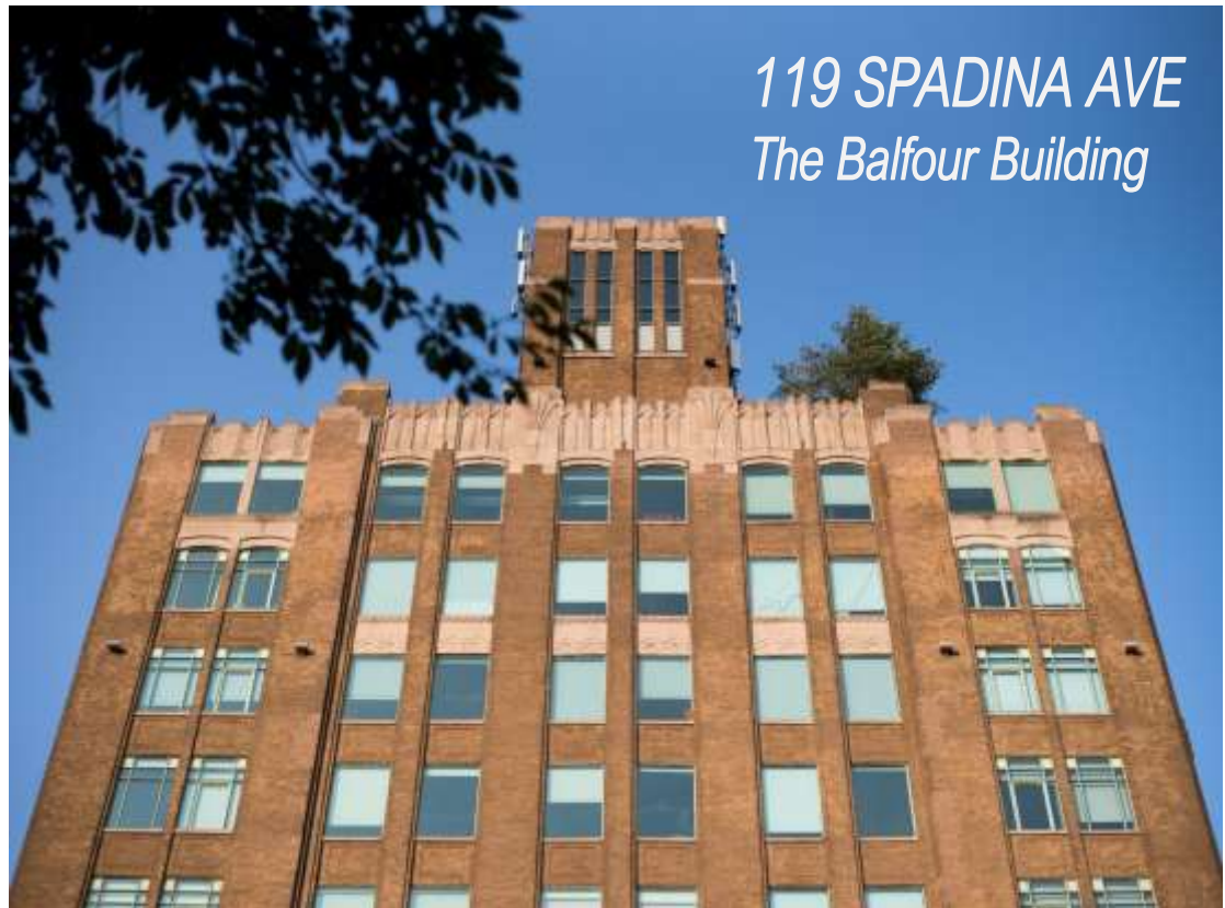
119 SPADINA AVE The Balfour Building