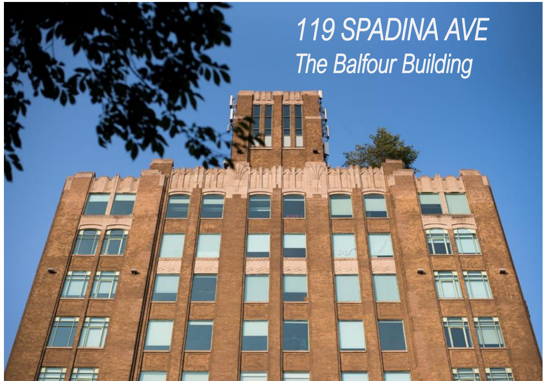
119 SPADINA AVE The Balfour Building

Rooftop terrace with WIFI for tenant enjoyment VIEW HERE